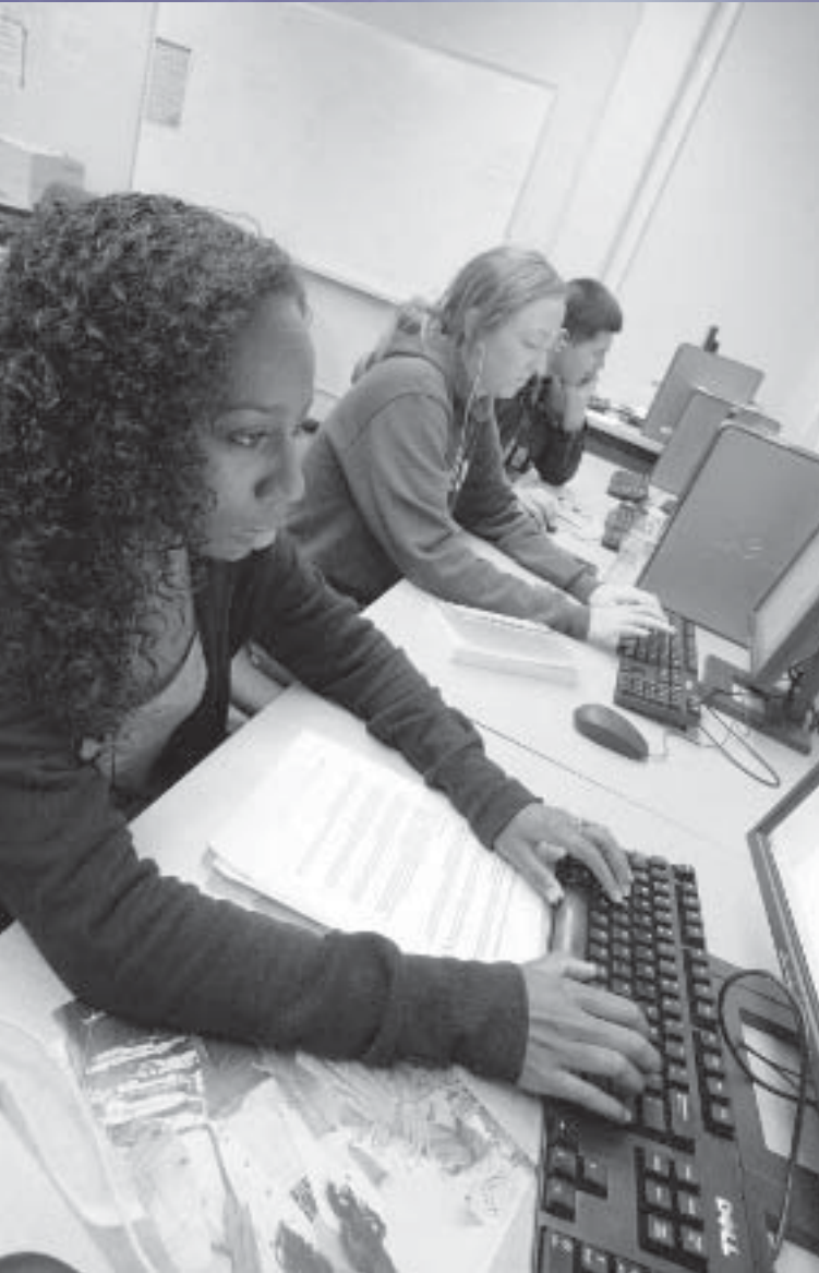
FCC Student Athletes take a time out to focus on academics.

If you’re interested in supporting The Zone, please contact SCCC Foundation at (559) 244-5991 or email gurdeep.hebert@sccd.edu .