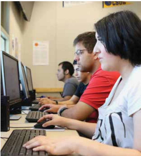
Madera Career and Transfer Center students researching information on selecting a major or requirements for transferring to a four-year college or university

CTC counselors provide information regarding University transfer requirements for California State University (CSU), University of California (UC), and private colleges and universities. They also assist with course planning, Student Education Planning (SEP), career exploration and counseling, career workshops, job search, resume writing, and UC and CSU application workshops. Additionally, students are able to schedule one-on-one appointments with University Outreach staff from Fresno State, UC Merced and Fresno Pacific University.